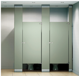
Floor to Ceiling