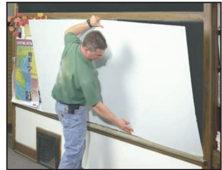
3 – Lift into Place

STEP 3 – Lift into place (The MagnaSkin is light enough for 1 person to install but is recommended for 2-3 people to keep from flexing and to insure that it stays level). Starting at the bottom edge, make contact with the surface and roll securely into place all the way across a few inches up to insure that it stays level while keeping the top away to avoid making contact.