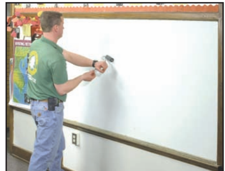
4 – Roll to Secure

STEP 4 – Start working your way up from the bottom evenly across the entire area rolling firmly to ensure complete contact with no air bubbles.